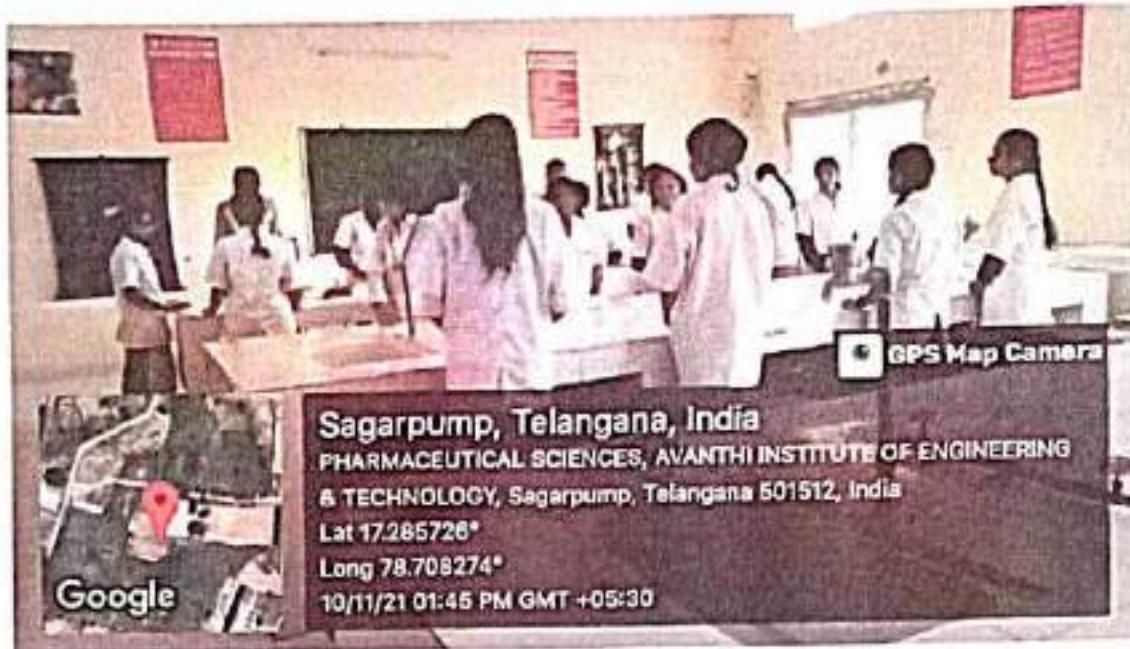
Human Anatomy and Physiology lab