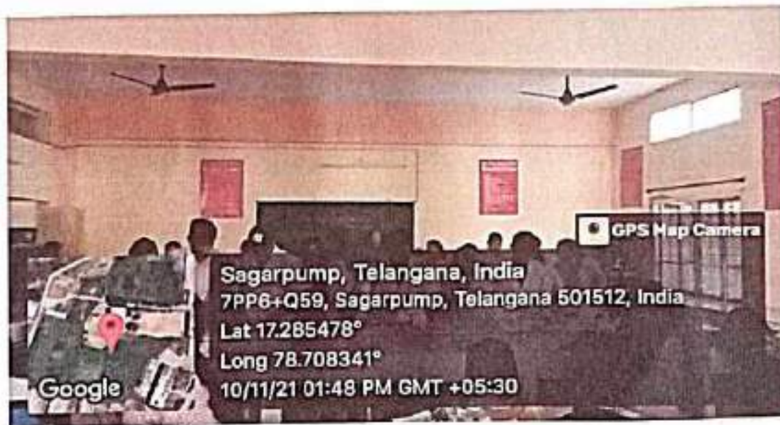
Pharmacy Practice Lab

Avanthi Institute of Pharmaceutical Sciences Ganthapally (V), Abdulgopurmet (M), Ranga Reddy Dist.