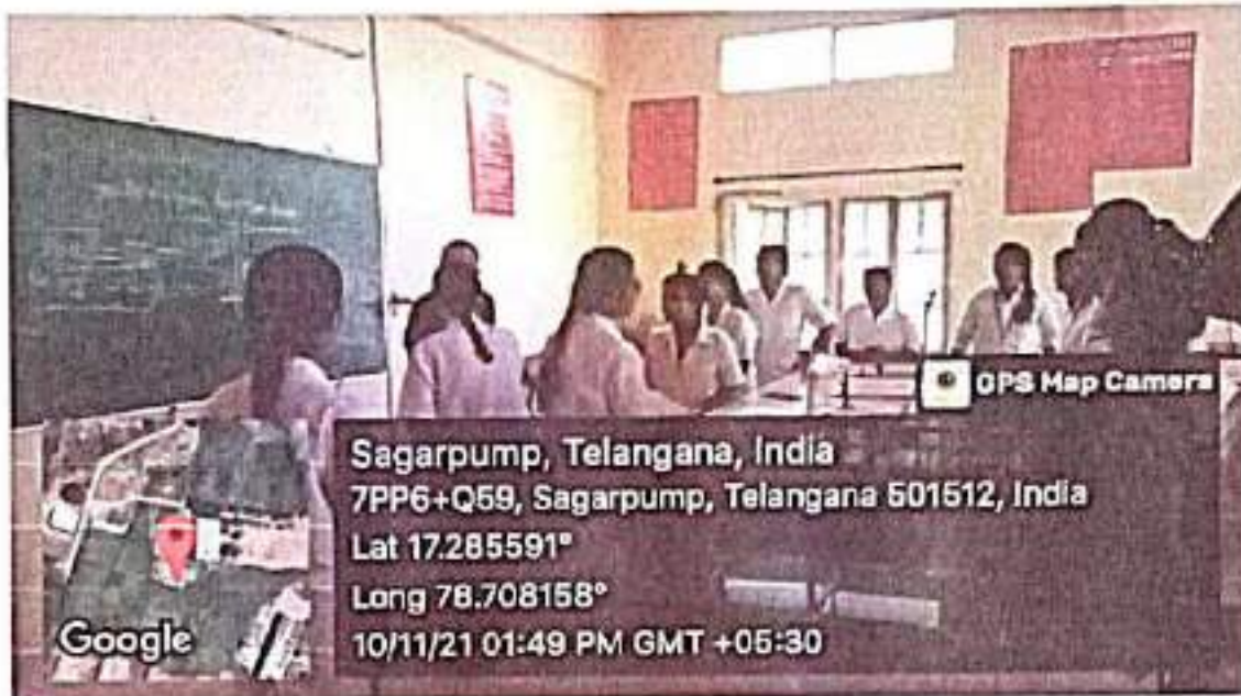
Physical Pharmacy Lab