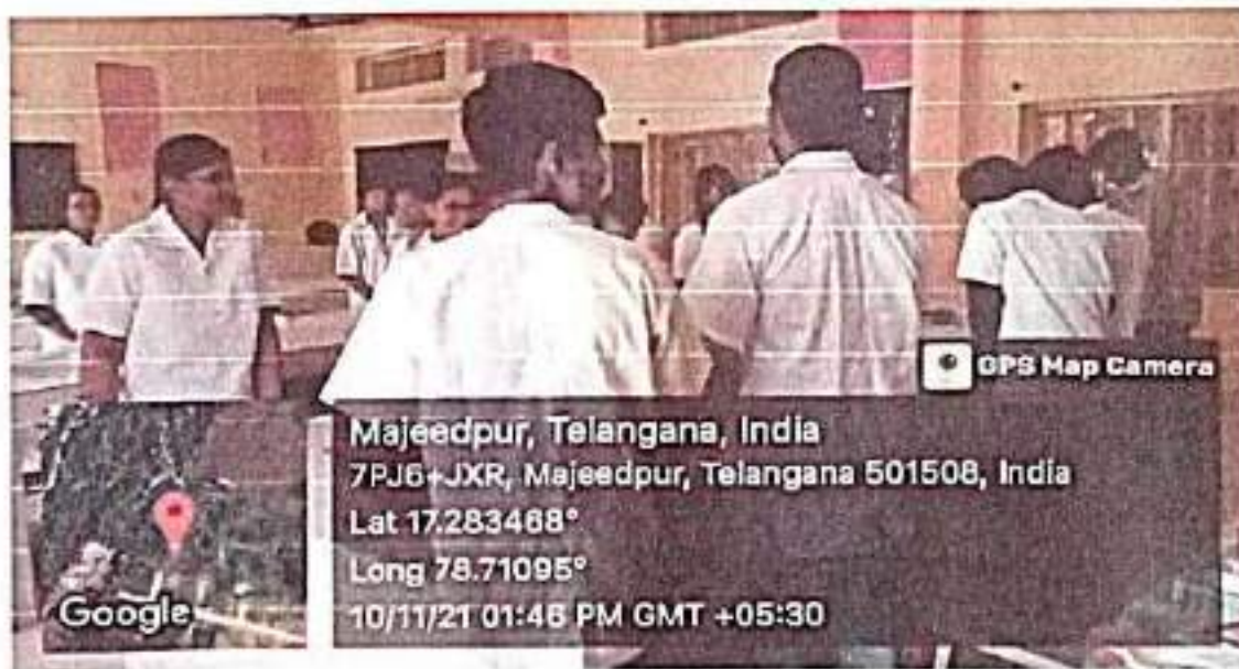
Pharmaceutical Chemistry lab

Avanthi Institute of Pharmaceutical Sciences Gumthapally (V), Abdullapurmet (M), Rangareddy Dist.