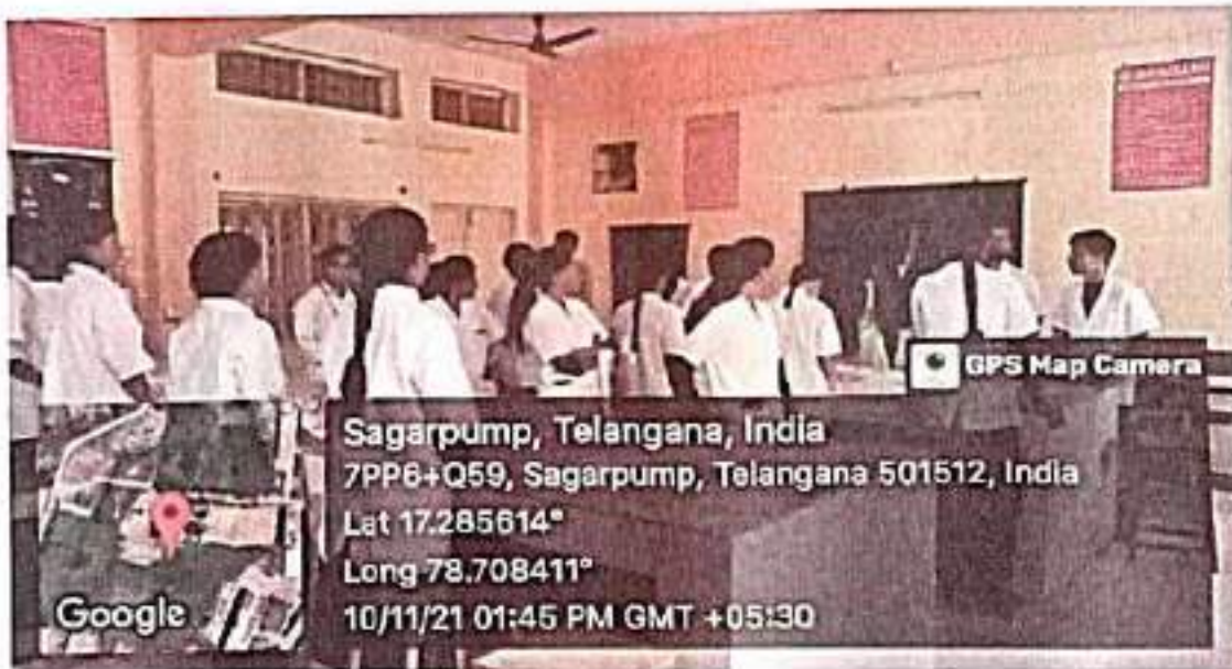
Human Human Anatomy and Physiology lab

Avanathi Institute of Pharmaceutical Sciences Gunthapally (V), Abdullapurmet (M), Rangaj Reddy Dist.