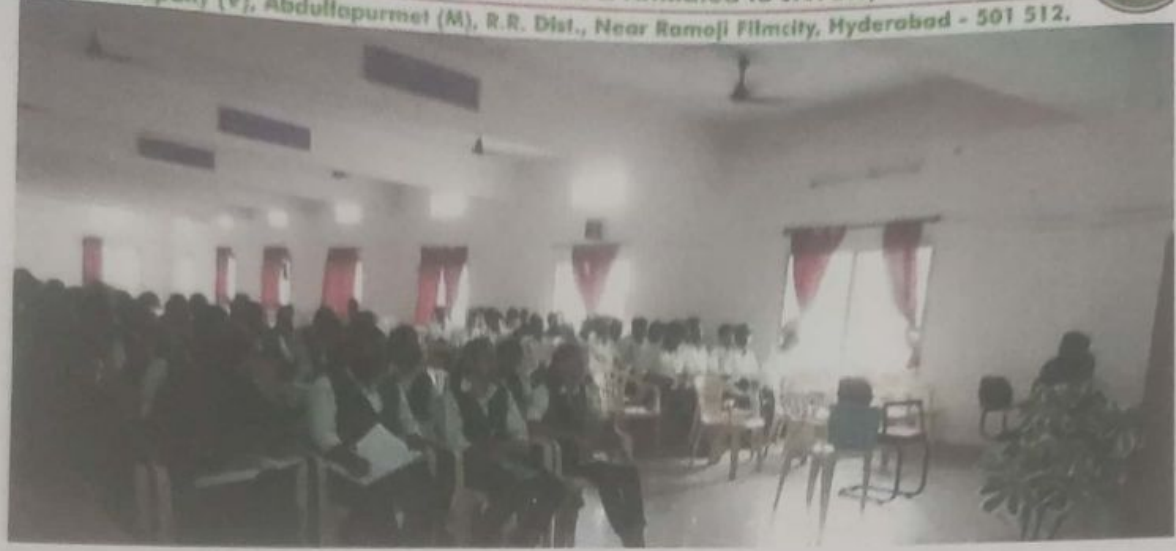
Guest lecture for MEDICINAL CHEMISTRY

- PRINCIPAL Avanthi Institute of Pharmaceutical Sciences Gunthapally (V), Hayath Nagar (M), Ranga Reddy Dist.